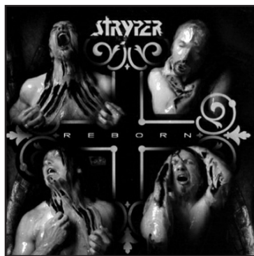
Stryper Reborn Big 3 Records