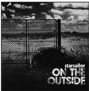
Starsailor On the Outside EMI